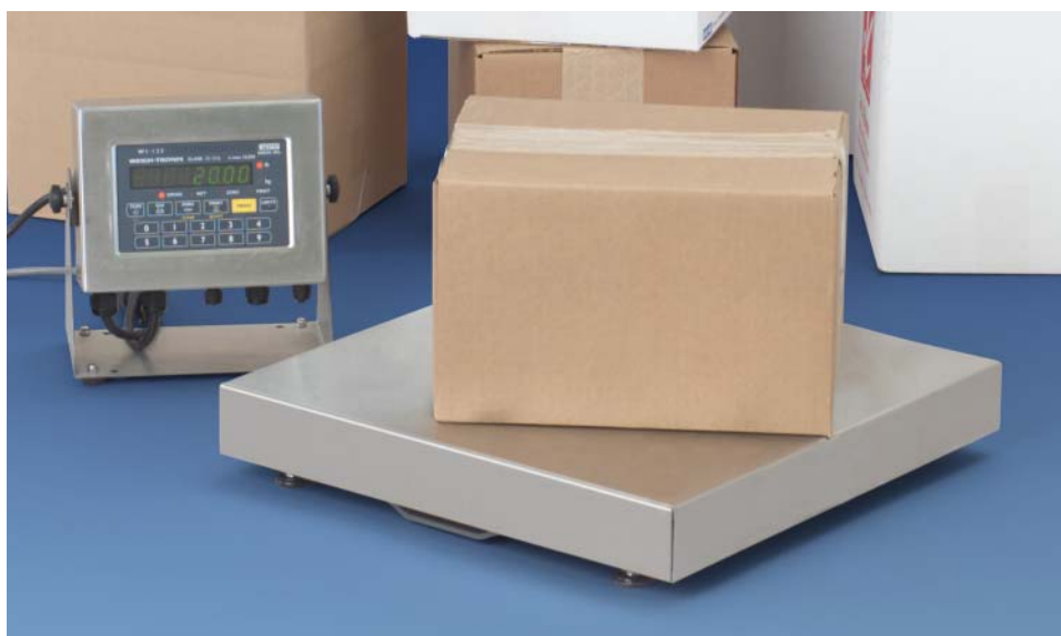
3735LP model shown with optional Avery Weigh-Tronix WI-125 indicator.

Agencies – NTEP Pending (5,000 divisions Class III, C.O.C. # 02-069), UL/CUL